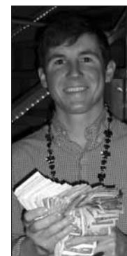
And the winner is... See page 14.