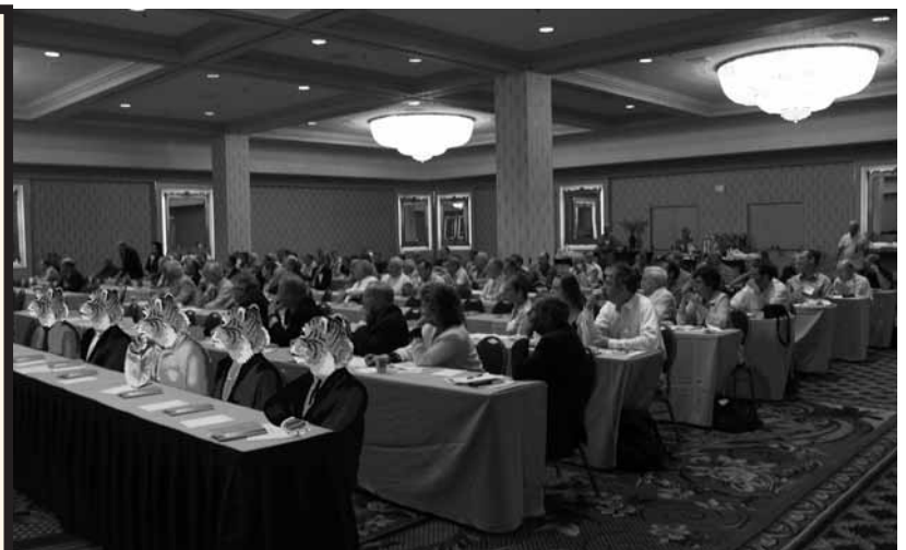
Scientific Session in progress