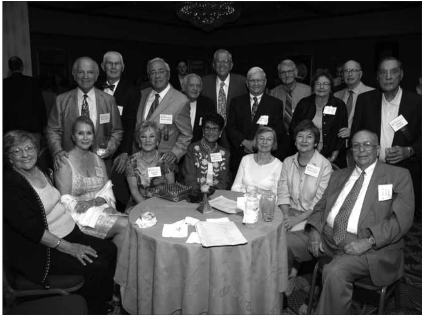
The Class of '56 gather at the Cocktail Party.