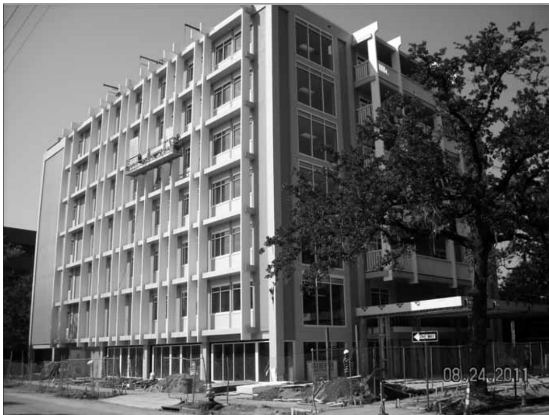
The new location for the LSU Faculty Group Services, at 3700 St. Charles Avenue.

These represent clinical services that are provided directly by the faculty of the School of Medicine. Soon after opening for services, this location will also be ready to provide radiology and laboratory support for patients seen at this location. For additional information on how to refer to this practice or make an appointment, feel free to visit our website at LSUHN.com .