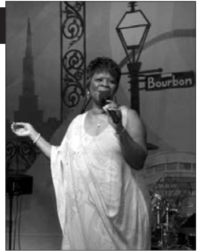
Irma Thomas and her band add to the festive mood.

Your Alumni Association is already planning to stage its Third Annual Gala on October 18, 2008.