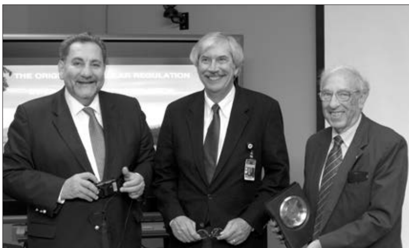
Dr. Fischer, far right, receiving plaque ( see text, left, for complete details ).