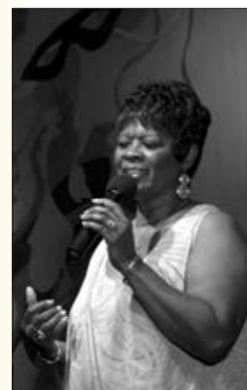
Irma Thomas and her band set toes to tapping.