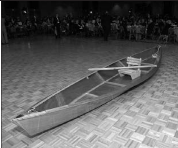
A pirogue, custom-made by Harold Bienvenu III ('79) was one of the more unusual items available in the Silent Auction