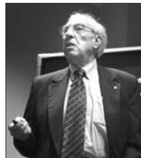
Nobel Prize-winner Edmund Fischer lectures at the Neuroscience Center. See page 27.