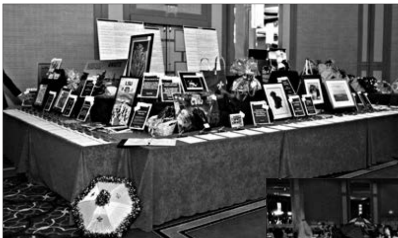
Tempting items on the auction table