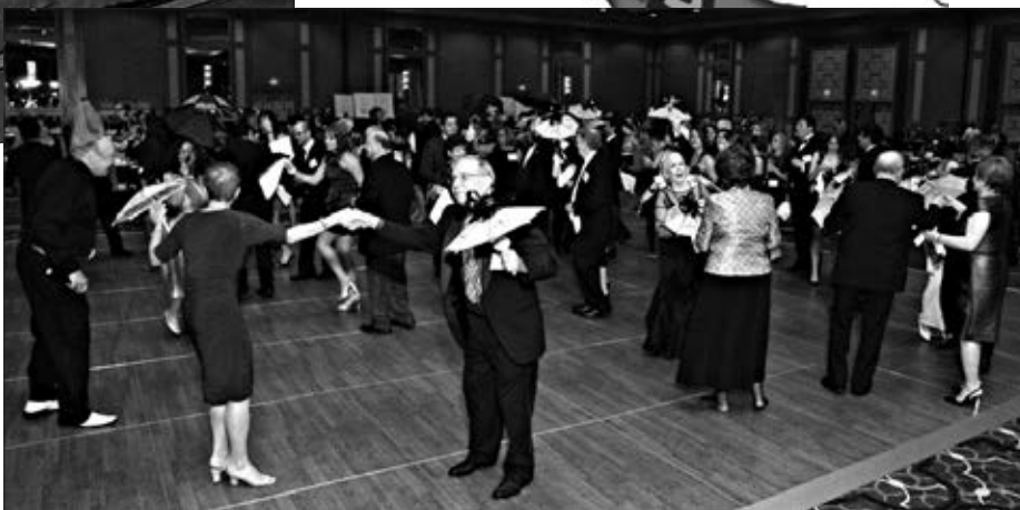
Dancing the night away

Mark your calendar for the 2013 Purple & Gold Gala. October 11, 2013 See page 26 for details.