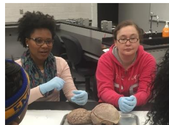
Medical students demonstrating organs and systems.