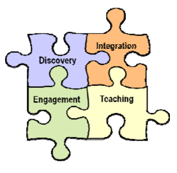
Four Domains of Scholarship (Boyer, 1990)