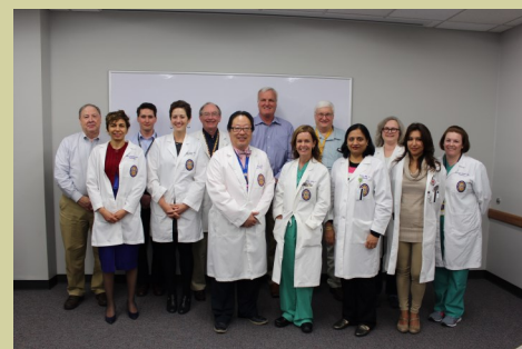
2016 Pathology Faculty