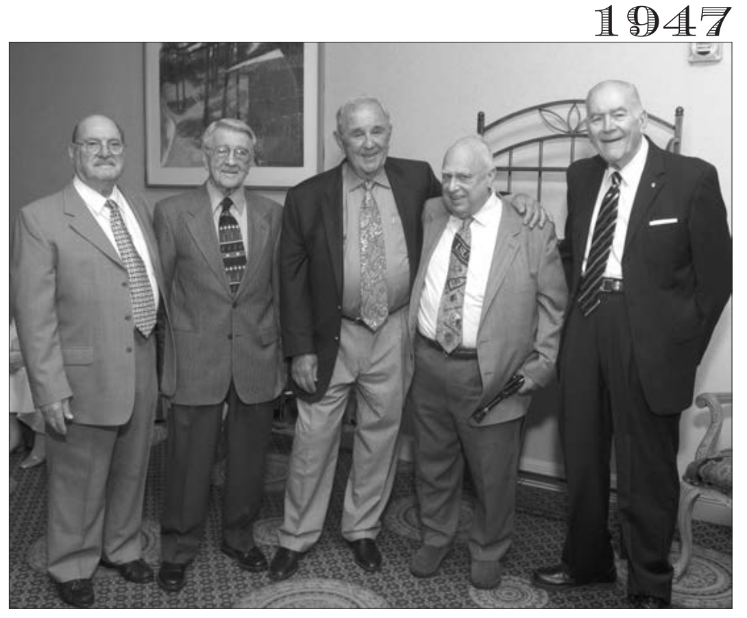
LSU Medicinews - Fall '07 www.medschool.lsuhsc.edu/alumni_affairs