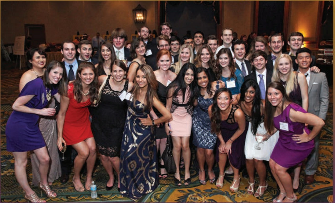
LSU Medical School students on board the USS Tiger. For more pictures of the 8th Annual Purple & Gold Gala, see pages 18-22.