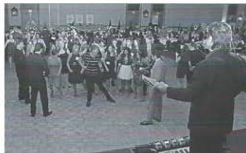
Dancing to The Topcats at the Purple & Gold Gala. See pages 18-22 for photos.