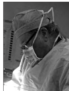
Live Purple Love Gold