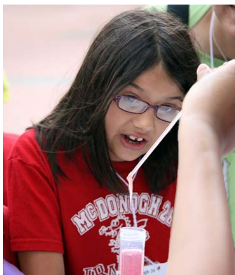
A Zoo visitor watches fascinated as DNA is isolated from strawberries.