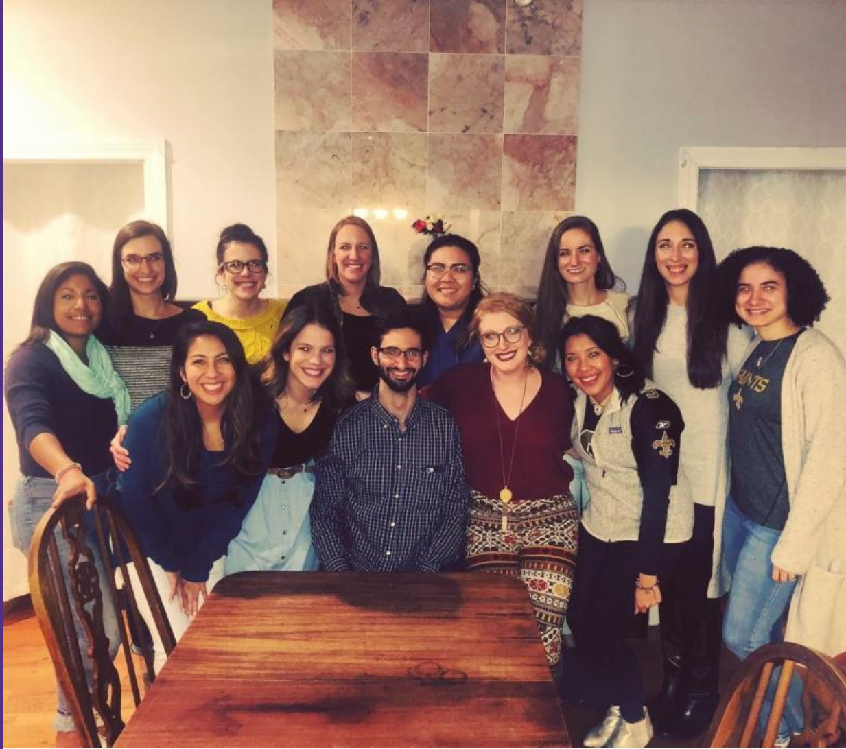
Pediatric interns celebrating "Friendsgiving."