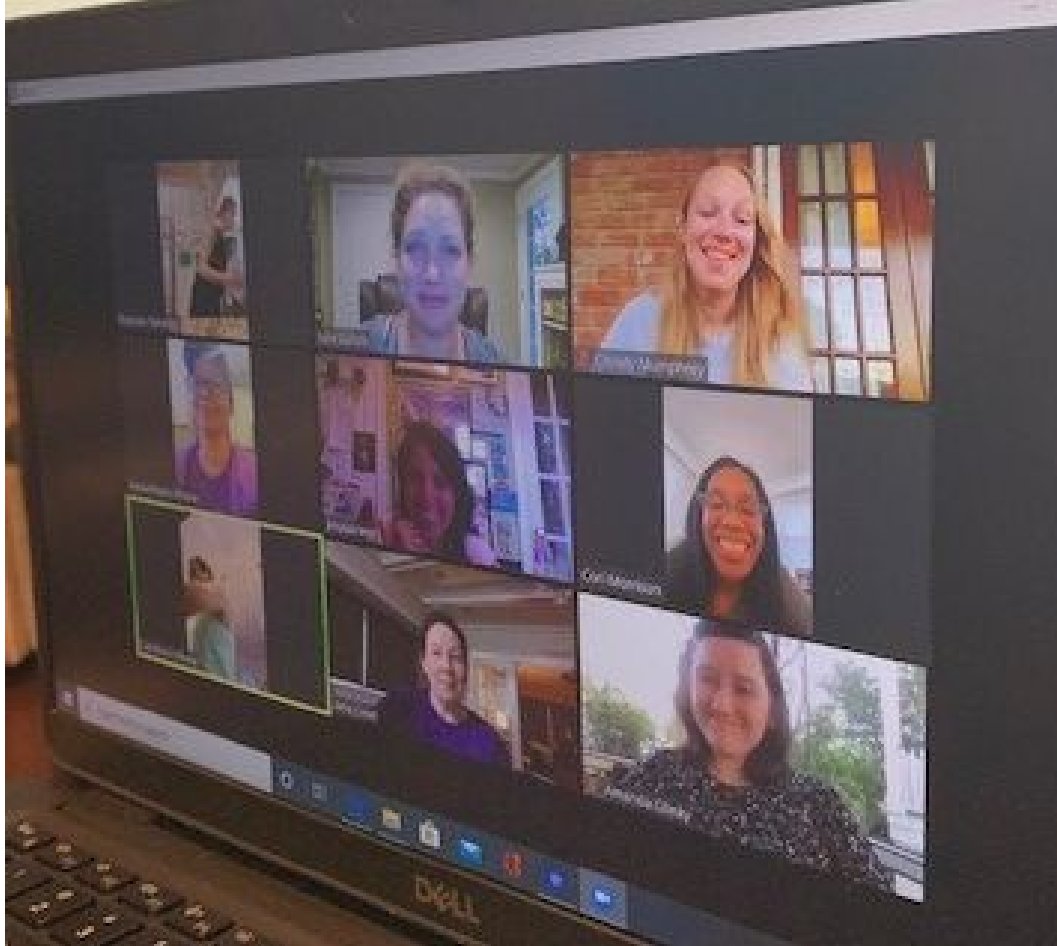
The residents received a well-deserved Wellness Resident Luncheon from Dickey's BBQ a few weeks ago.