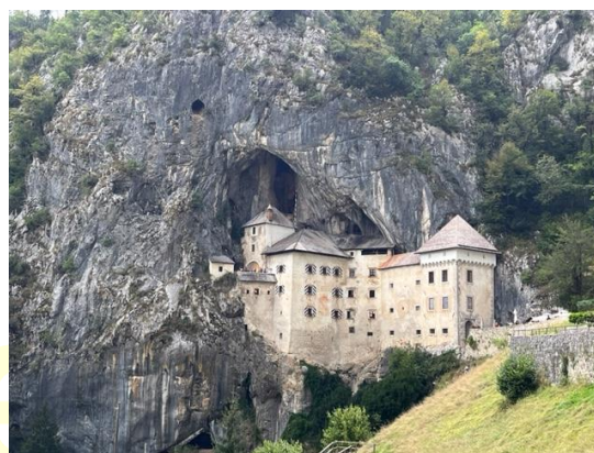
Predjama Castle, Renaissance castle built within a cave mouth in south-central Slovenia.

I recently read an article that speaks to the burnout that many of us can and have experienced at one time or another. I wanted to share the main messages from the article. The author described burnout as consisting of three main elements of emotional exhaustion, inefficacy, and cynicism. The article spoke of ways to deal with these elements, which included a) developing emotional literacy as well as awareness of one's emotional state; b) increasing awareness of negative thoughts and trying to appreciate and recognize the value we each bring to the institution or department, and c) giving and receiving empathy. As we make our transition into the Fall, I invite you to take time to reflect on your accomplishments, to make time to appreciate and enjoy all the blessings and gifts we receive, and to remember to reach out to someone offering support and encouragement. Everyone around you is a husband, partner, wife, mother, brother, or sister with their own personal challenges to deal with. Let's make the Fall of 2023, the season of compassion and empathy. Don't forget how much we have to be grateful for!