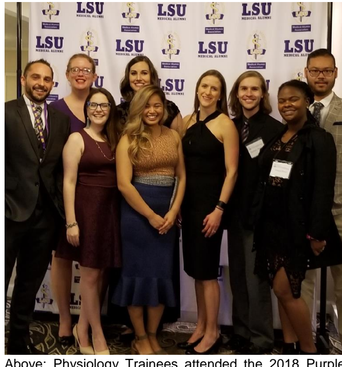
Above: Physiology Trainees attended the 2018 Purple and Gold Gala.

Images of the Appalachian Trail (above) and the Habersham Winery (below) from the Edwards' trip.