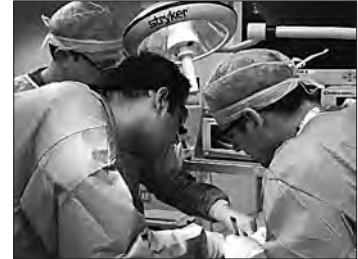
LSU Vascular Surgery leads the way in resident education. See story, page 22.