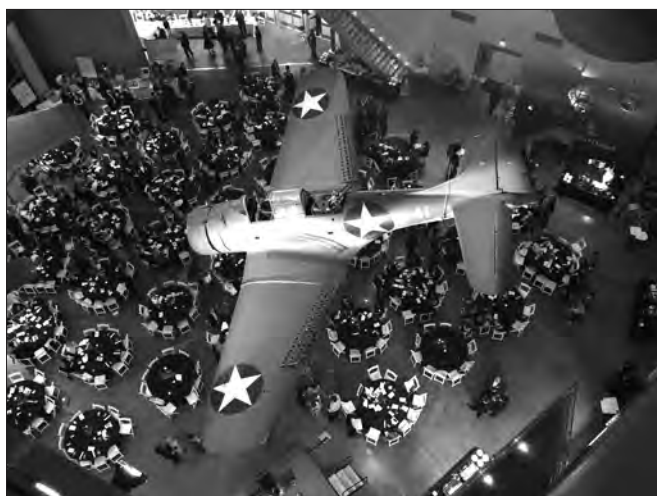
Overview of the event