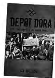
Books by alumni - see page 24