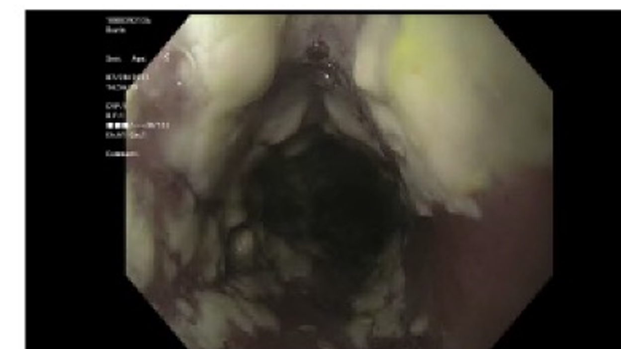
5 Middle Third of the Esophagus