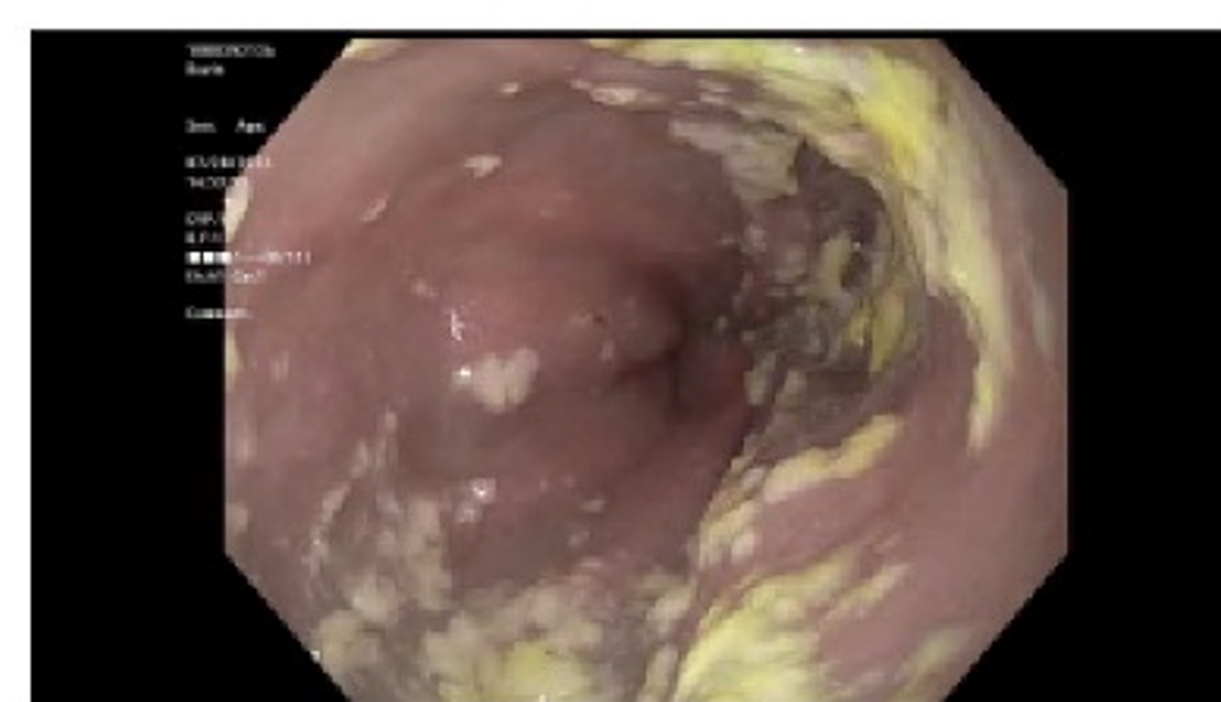
1 Lower Third of the Esophagus