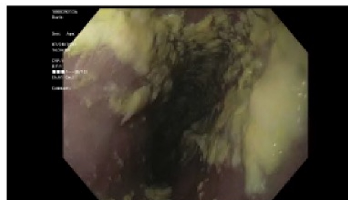
4 Lower Third of the Esophagus