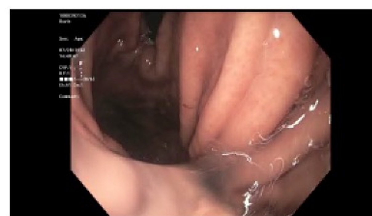
2 Gastric Body