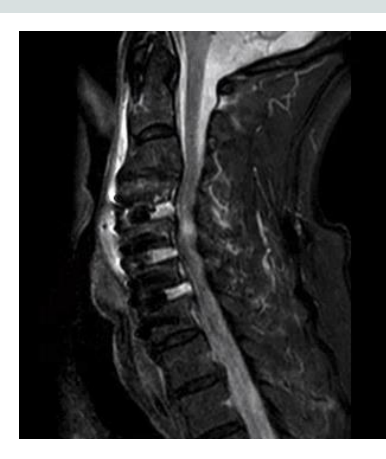
Figure 1. Pre-operative cervical MRI indicating cord compression at the C4-C7 level. The patient initially presented with upper extremity paresthesia and motor dysfunction. This prompted the imaging and surgical planning for the 3-level ACDF at C4-5, C5-6, and C6-7. Surgery was scheduled and performed approximately 1 week after imaging and consultation.

Figure 2. Initial post-stroke CT head with contrast following onset of dysarthria, right facial droop, hemiparesis, and hoarseness. Acute infarcts are visible in the right cerebellum, left cerebellum, and left pons. Subsequent CTA revealed a thrombus in the V2 segment of the right vertebral artery. The pontine infarct reflects basilar artery involvement.