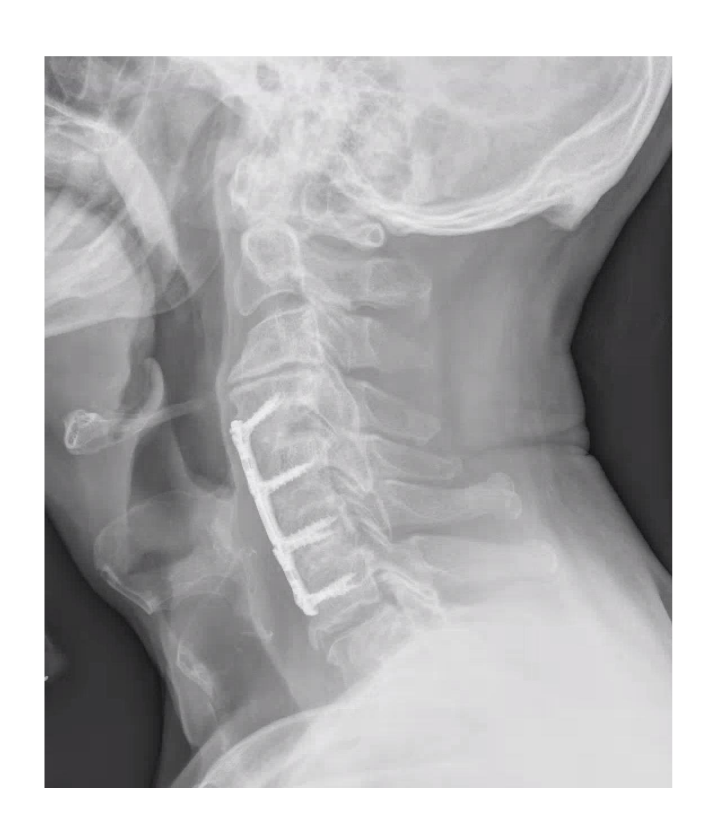
Figure 3. 11-month follow-up x-ray of the cervical spine. Radiograph indicates no hardware complication or loose screws and partial cervical fusion from C4-C7.