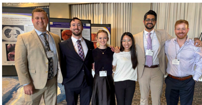
Regional ACG Conference in March