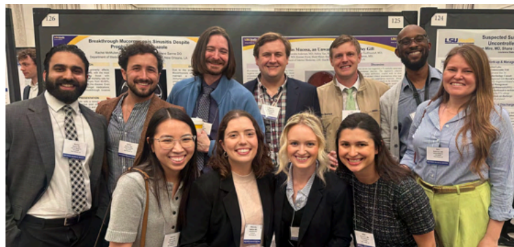
SSCI Southern Regional Conference in February