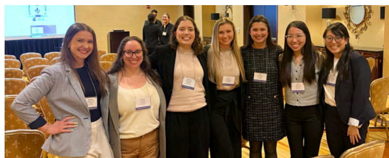
Regional ACP Meeting in April

Presented posters at the American College of Cardiology Conference 2025 Annual Meeting in Chicago!