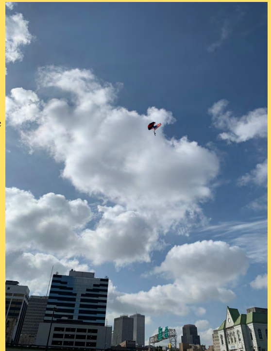
US Army Black Daggers Parachute team—3 land at UMC 7/10/20