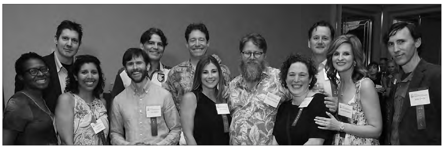
Members of the Class of 1999