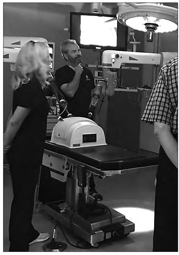
From TransEnterix—Thank you, LSU Medical Alumni Association, for inviting us to demonstrate #Senhance Surgery during the 2019 Alumni Reunion Weekend Tour. We enjoyed discussing #RoboticSurgery and MIS #innovation with alumni members!