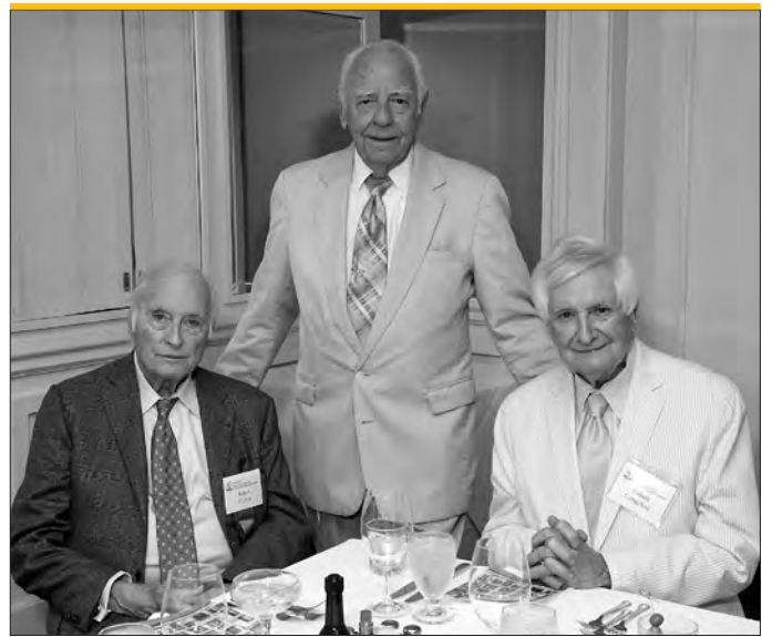
Class of 1954