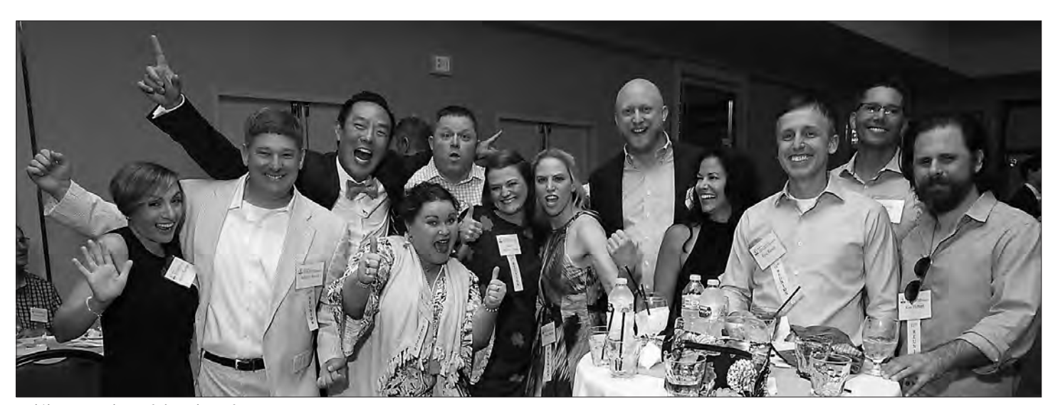
Jubilant members of the Class of 2004