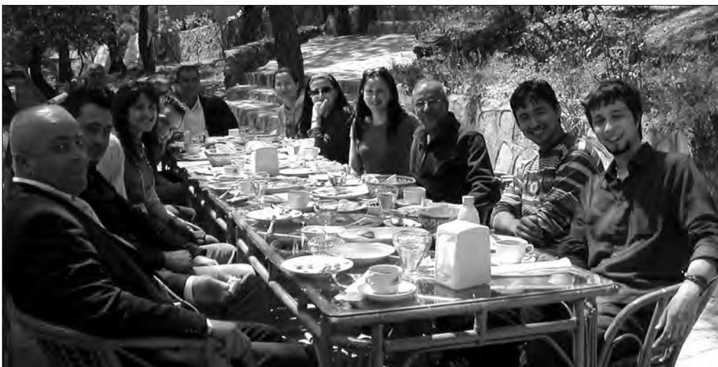
Hard work is rewarded by a picnic given by Ege University in Izmir, Turkey