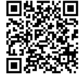
BR Regional Campus