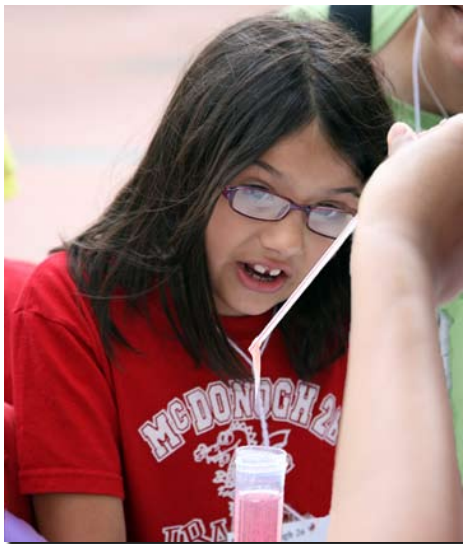
A Zoo visitor watches fascinated as DNA is isolated from strawberries.