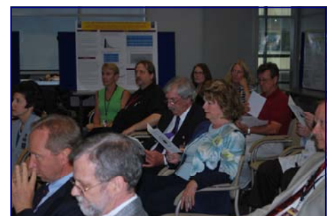
Faculty and education leaders attend the 2009 Academy Induction Ceremony that followed the Educational Scholarship Day.