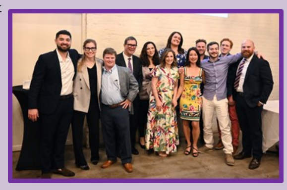
Pictured above: The 2023 graduates.