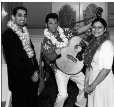
The couple is serenaded Elvis-style by... is it? Could it be...?