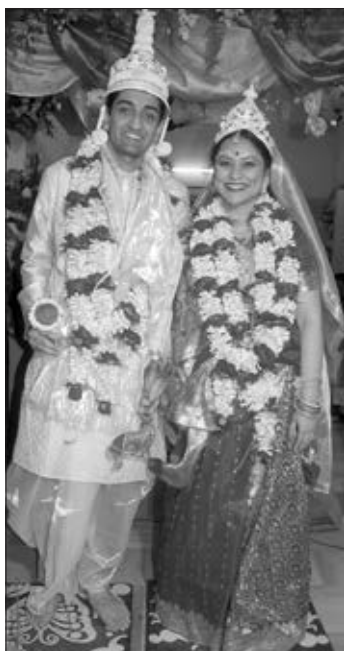
Wedding in India