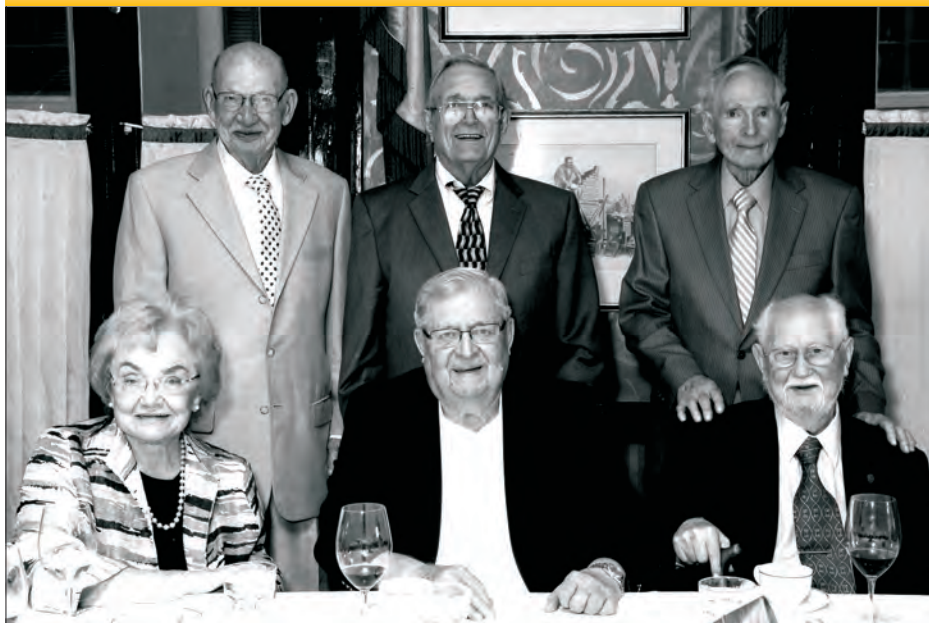
Attending members of the Class of 1955 (photo, left)