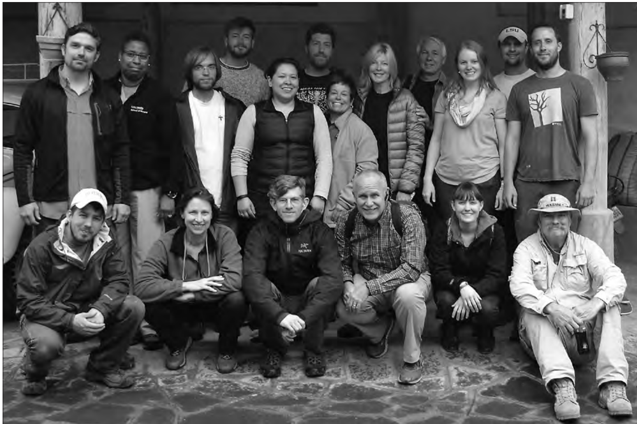
Global Health Peru Team