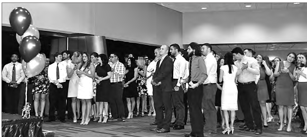
LAs eagerly awaiting their name to be called to find out where they'll match.