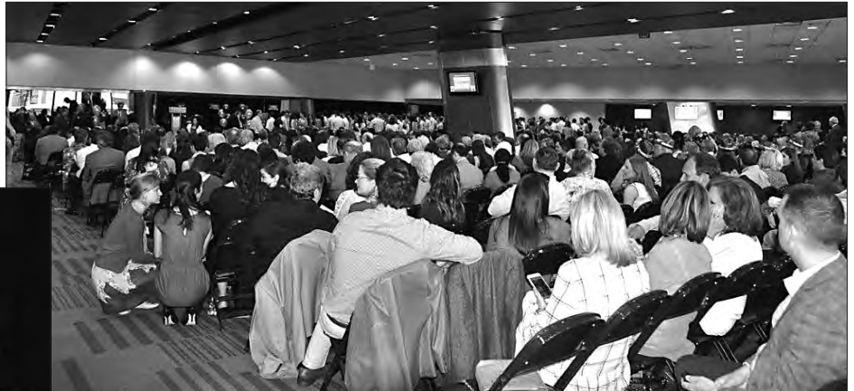
Families and friends wait in anticipation!