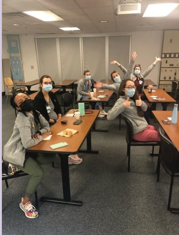
Heal the Healer event: