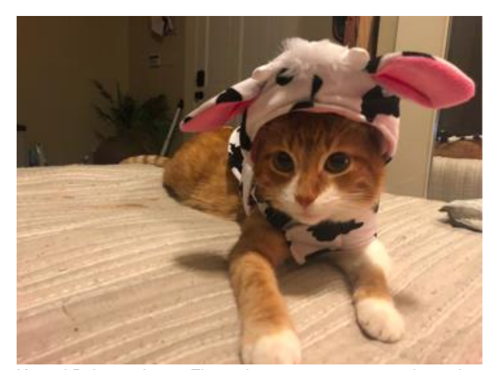
Krystal Belmonte's cat, Zippy, demonstrates a new spin on the "Cat-Cow."